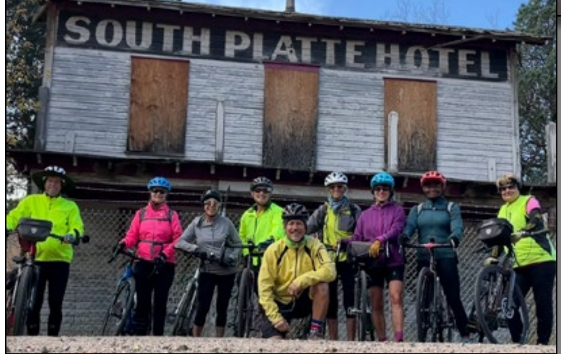
On October 3rd, 2023, many riders took to the trails heading from the S. Platte Hotel to Deckers. Along the way, they enjoyed many of the emerging fall colors.