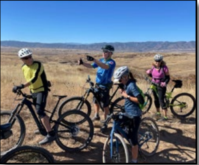
On October 25th 2023, a group of mountain bikers set out along the trails of the Backcountry. Vistas, views, and smiling faces!