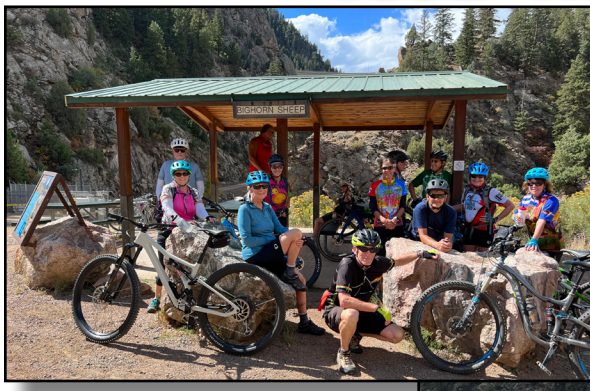
On September 30th, Mountain Bikers made their way through Waterton Canyon.