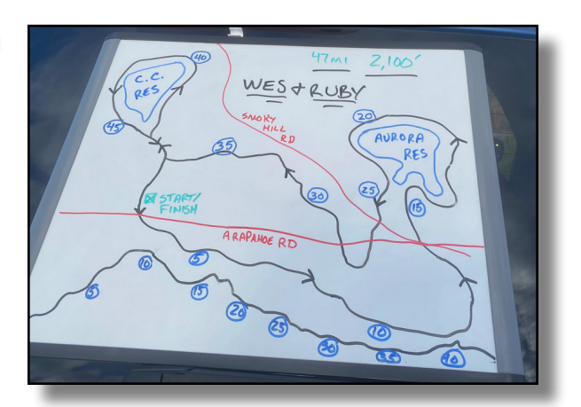
MTB 3 Sisters