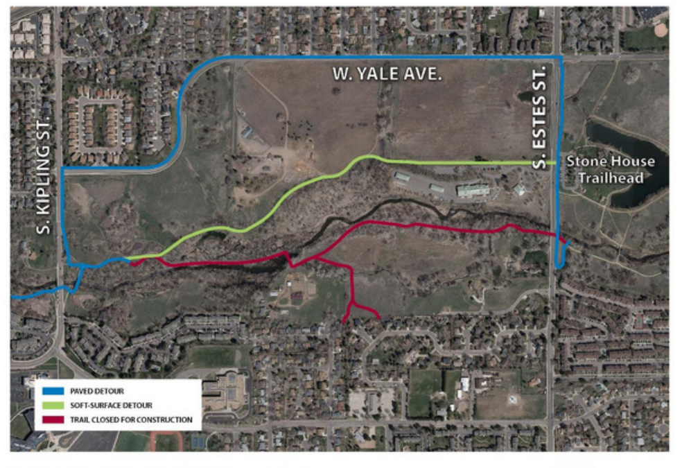
BEAR CREEK TRAIL IMPROVEMENTS: PHASE 4 (July 18-December 23, 2022)

Phase 6 of the Bear Creek Trail is now open from S. Kipling St. to Fox Hollow Lane. The only current closures are the Bear Creek Trail from S. Estes to S. Kipling Streets and the Stonehouse Bridge.