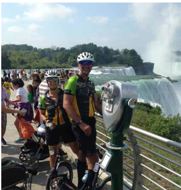
Spokes Fighting Strokes Sea to Sea Day 84: We're at Niagara Falls!!

Follow us on facebook and Twitter as well as Dan's website, SpokesFightingStrokes.org as we blog our way across the US.