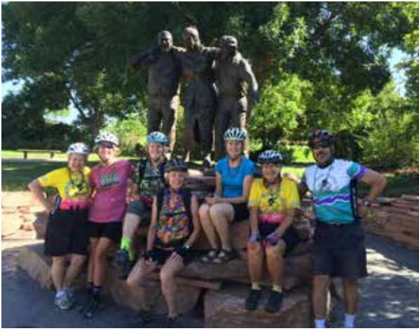
At the 9/11 Memorial during the Saturday morning Aug 13th Space, Time 9/11 Ride.