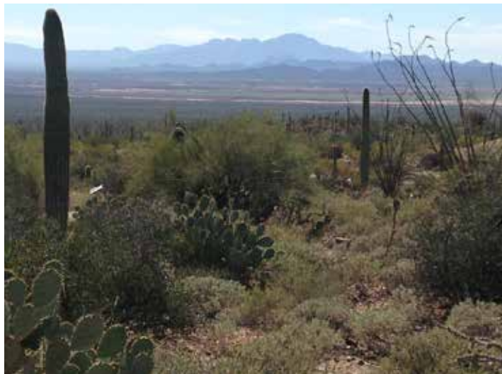
View from the Arizona Sonoran Desert Museum

You should be an independent, intermediate level rider capable of doing your own tire and bicycle repairs if needed. You must be comfortable riding on roads with traffic.