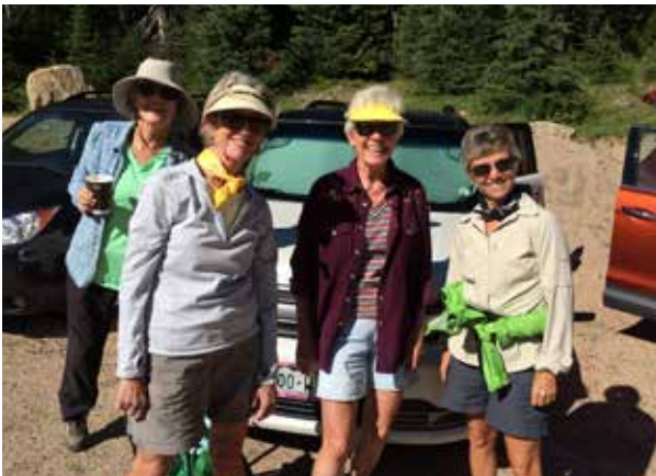
DBTC hikers gather in the parking lot near Winter Park on Saturday, July 23rd.