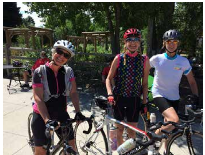
On Sunday, July 24th six riders received free beverages at the stop at Hudson Gardens.