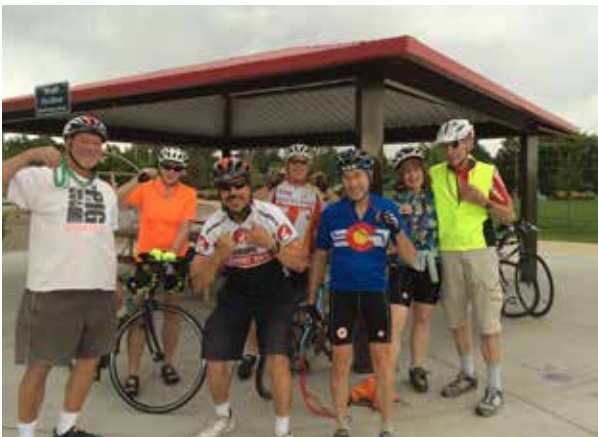
In spite of the threatening weather, 7 riders showed up for the evening Majestic Mystery Ride on Tuesday August 9th. They were rewarded with a mystery surprise of beads and then the ride was quickly aborted before the rain arrived!