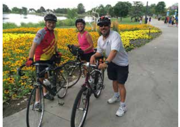
The clouds were threatening so only 3 riders showed up for the Tuesday Evening DBTC Ride on August 2nd. We turned around when the rain hit at EB Rains Memorial Park shown here.