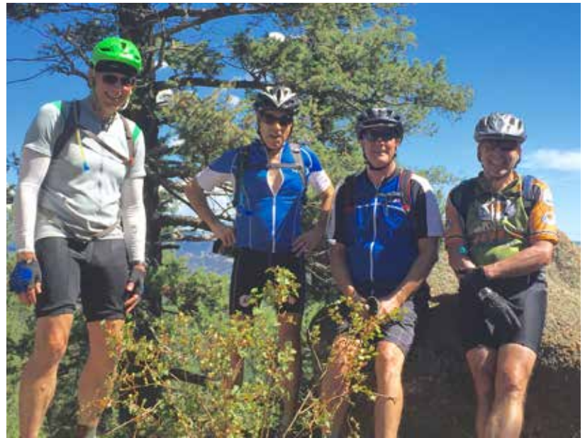
DBTC MTB Riders at Scraggy Peak