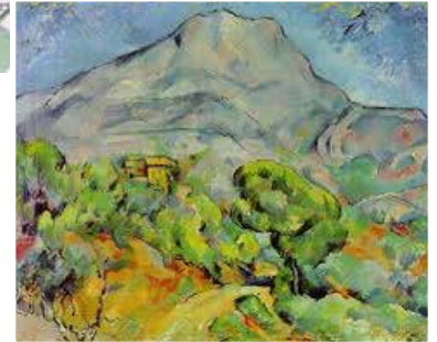
My Bucket List ride—50K around Mt. Ste. Victoire (painted often, as above, by Impressionist Paul Cézanne), was tough but très satisfying. Bike rental was from Aix Prit Vélo.