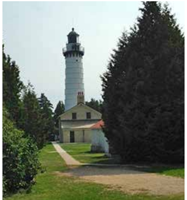
Door County's beautiful Cana Lighthouse above; the group gathers at Cave Point Park and Washington Island, below.

DBTC's Bike and Brews tour to Fort Collins was a resounding success! A group of 13 participants plus 2 leaders enjoyed outstanding weather as they rode along the beautiful Cache la Poudre in Fort Collins and enjoyed beer tasting at area breweries. The first afternoon was a leisurely ride along the Spring Creek and Poudre Trails to New Belgium Brewery for a 90 minute Brewery tour, with a happy hour back at the hotel. On the second day the leaders offered longer and shorter ride options up the Poudre Canyon to Picnic Rock or the General Store. Several folks then enjoyed the pre-dinner optional Tap Room Tour of three different breweries, followed by a wonderful dinner at Coopersmith's Brew Pub in Old Town Fort Collins. On the final day the group rode east up the Poudre on the Poudre River Trail to Greeley and back, and then enjoyed a wonderful tailgate lunch at the trailhead before heading back to Denver. The trip was a great combination of biking and socializing over craft beer delights. Thanks to new out of town tour leaders Cyndy Klepinger and Helen Berkman for a great tour. Watch for more fun trips offered by the hard working DBTC OOTT leaders! More photos on page 9.