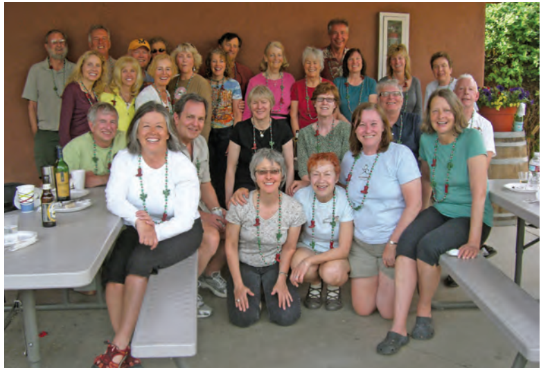
Moab photo – Group wearing their southwest Mardi Gras beads after our farewell pizza dinner