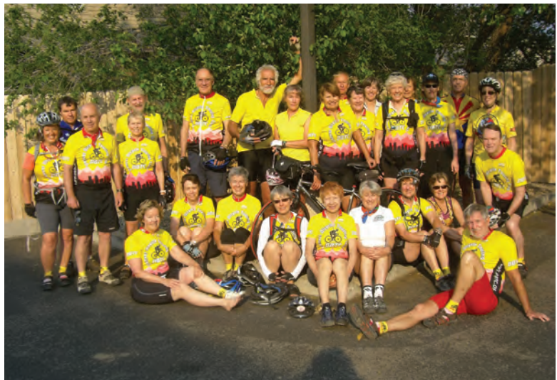
Enchanted photo – Group before our Bandelier ride in Los Alamos