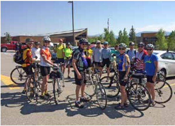
One of the groups gathering in Frisco where the rides began and ended.