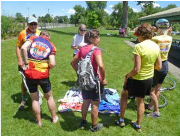
Shoppers at the bike gear swap.