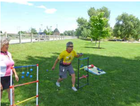
Lots of fun games were on hand at the picnic... so THAT's how it's done!