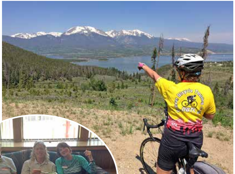
"We started from over there on the other side of the lake somewhere!"