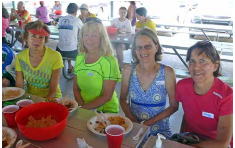
MTB ladies who lunch.