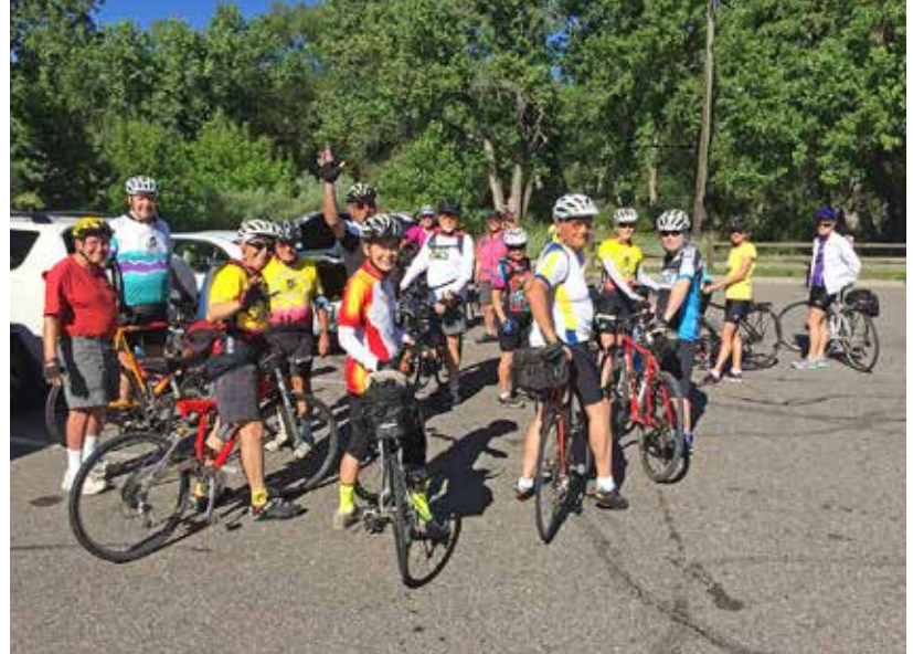
One of many riding groups gets ready to build up an appetite.