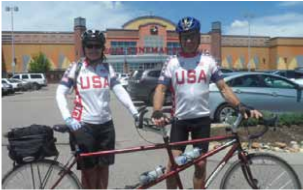
Below: A well-deserved break at Hudson Gardens.