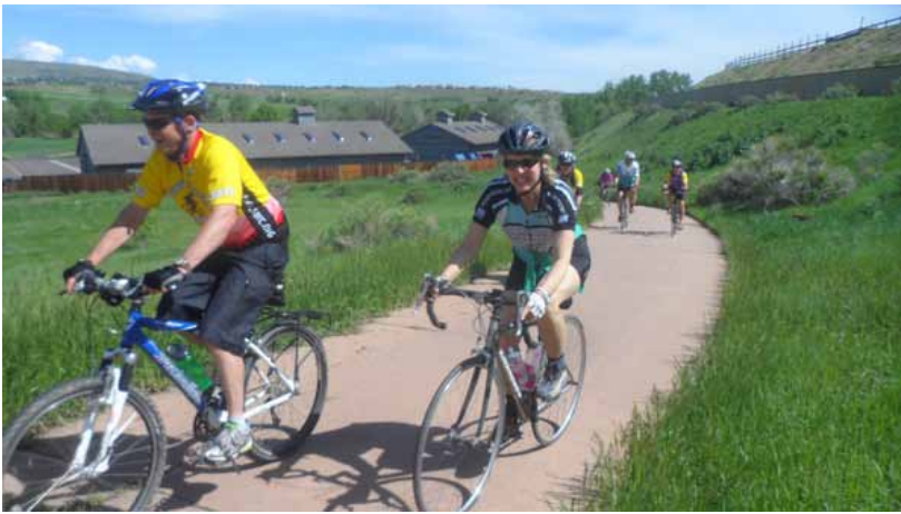
Above: Going up Mount Carbon