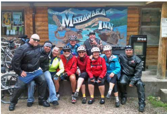
While waiting for the rest of the gang to show up, we asked these nice people to sit in for them...