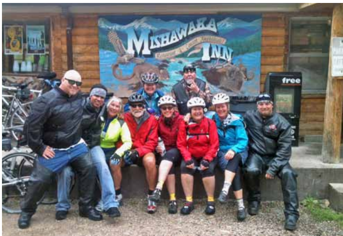
While waiting for the rest of the gang to show up, we asked these nice people to sit in for them...