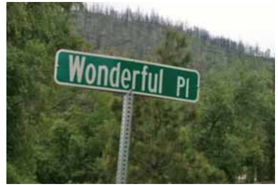
A justly-named side road along Poudre Canyon.