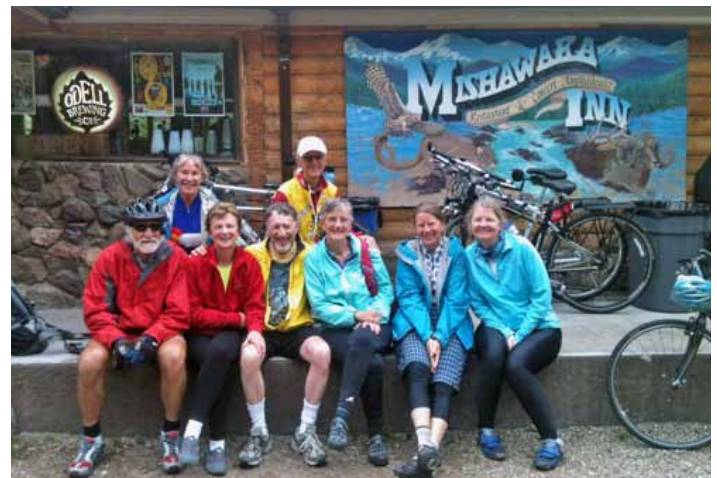
...and we all made it!