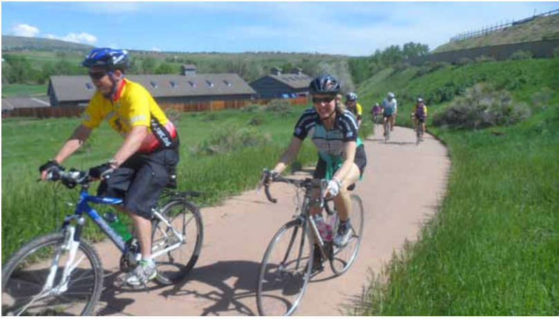
Above: Going up Mount Carbon