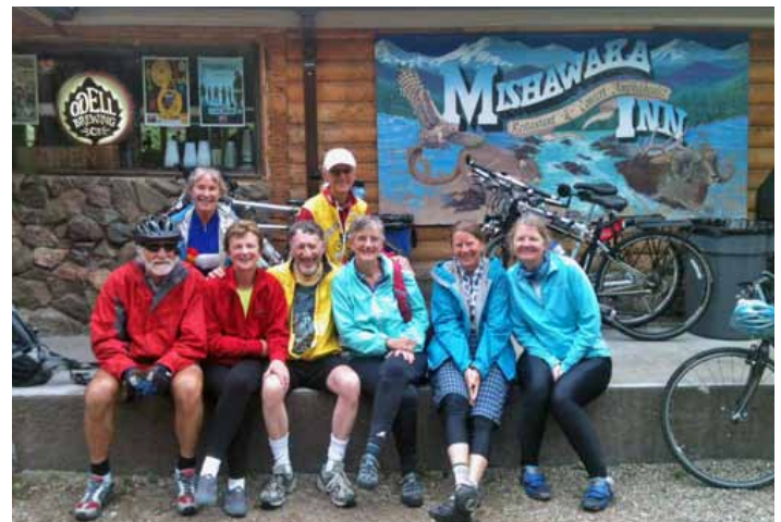
...and we all made it!