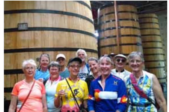
Everyone enjoyed a most generous tour de brew!