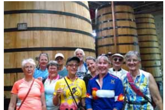
Everyone enjoyed a most generous tour de brew!